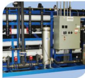
Reverse Osmosis Systems