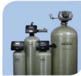
Commercial Water Softeners