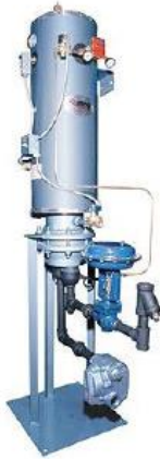
ThermoDyne HX Indirect Fired Water Heater

RECO USA Heaters and Tanks for Commercial and Industrial Applications