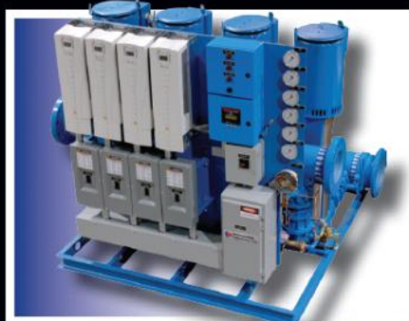
Water Booster Systems