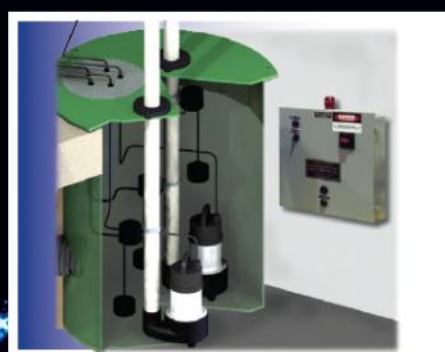
Sump Pump w/Control Packages