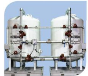
Iron Filtration Systems